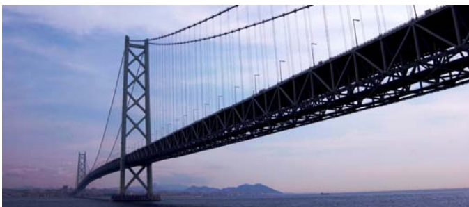
Akashi Kaikyo Bridge

Japan Society of Civil Engineers Shikoku Railway Company