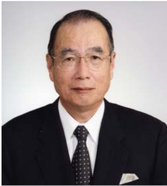
President Honshu-Shikoku Bridge Expressway Co., Ltd.

It is a great pleasure for us to host the 6 th International Cable Supported Bridge Operators' Conference and to welcome a lot of operators from various countries.