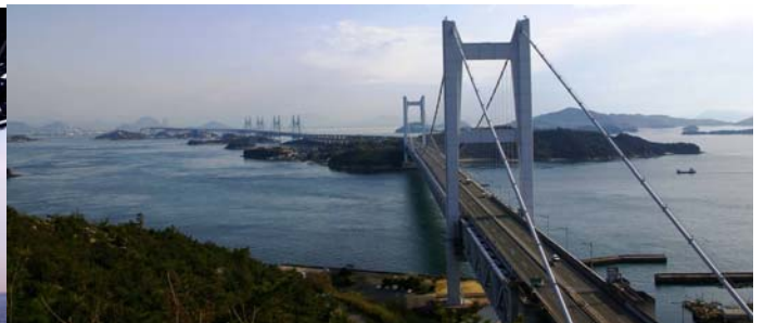
Seto Ohashi Bridges